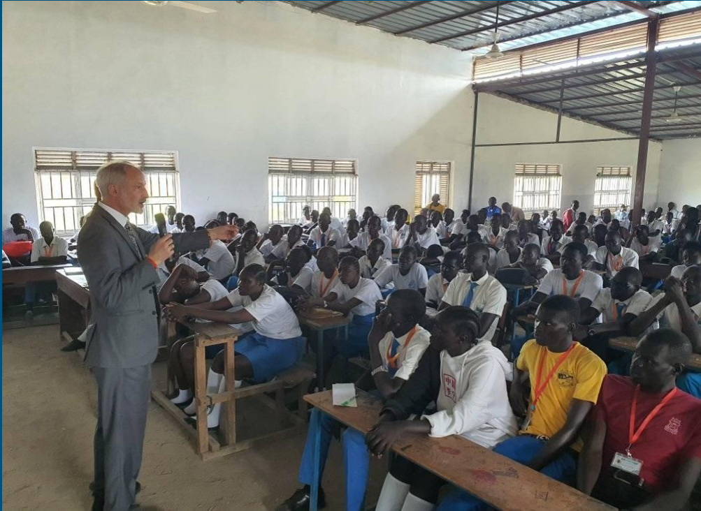
U.S Embassy Public Affairs Officer speaking to our students at our Peace Wings Hall.