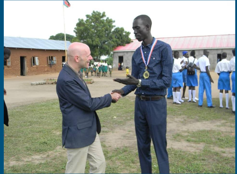
Former U.S. Ambassador to South Sudan at Promised Land Secondary School during a celebration of results when our students became the best in South Sudan National Examination