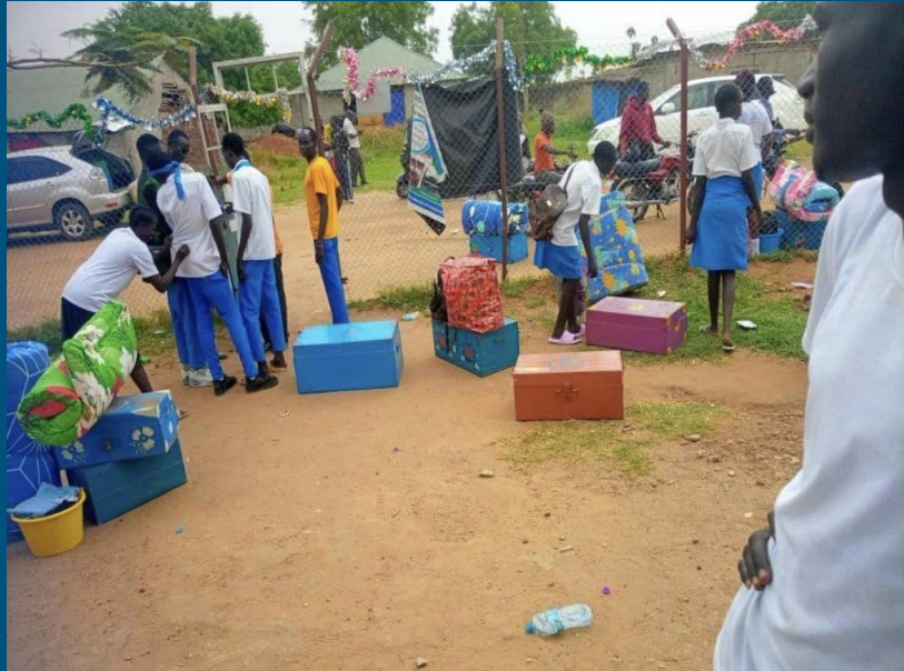
Girls leaving the school premises after their National Examination-March, 2023

We established girls' accommodation program in 2018 to provide a safe and secure environment for girls to avoid forced marriages, violence and discrimination in the community.