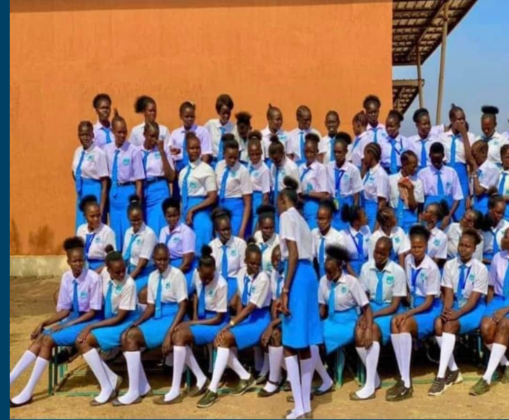
97 girls out 273 candidates graduated in March, 2023.