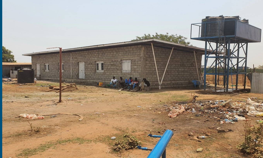
Girls Dormitory home to 300 girls but has become small to accommodate 624 girls who are currently enrolled at our school.