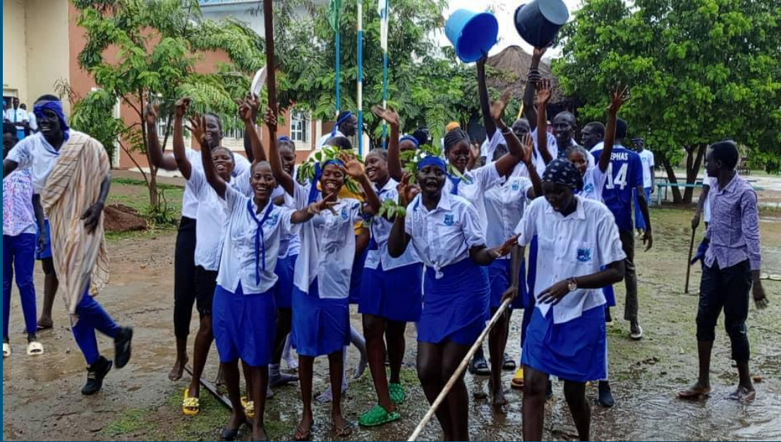
Students Dancing in the rain after finishing their last High School Examination. 2023.