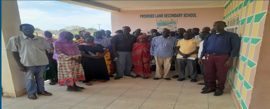
Parents attending school meeting on Gender Based Violence among students and families.